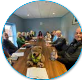
Unite Partnership - community collaboration

Over 55% of service users who come in for one service will then access our Advice & Guidance Service