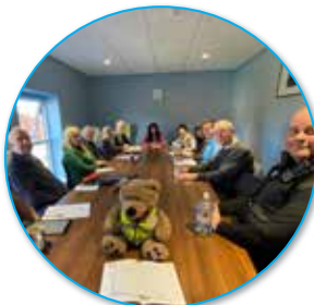
Unite Partnership - community collaboration

Over 55% of service users who come in for one service will then access our Advice & Guidance Service